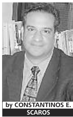
by CONSTANTINIOS E. SCAROS

4. As a follow-up, Americans' faith in the media continues to deteriorate, as reflected in poll after poll. The press seems to be increasingly biased and agenda-driven, whereas its news stories should be neutral and objective,