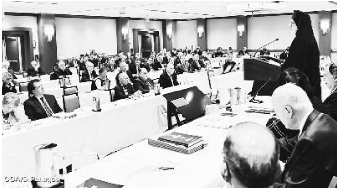
ABOVE: Archbishop Elpidophoros delivers his keynote address at the first Archdiocesan Council meeting under his presidency. BELOW: The members of the Archdiocesan Council giving a standing ovation to His Eminence Archbishop Elpidophoros at the conclusion of his speech.

Speaking about Holy Cross School of Theology the Archbishop said that "I will be frank with you: our School has been sinking for a long time. I saw it myself when I taught there fifteen years ago. What is the American expression? "Kicking the can down the road." No real solutions to the current problems, but rather mortgaging the future of the clergy by virtually bankrupting the School, and ignoring the requirements of the academic accreditation agencies